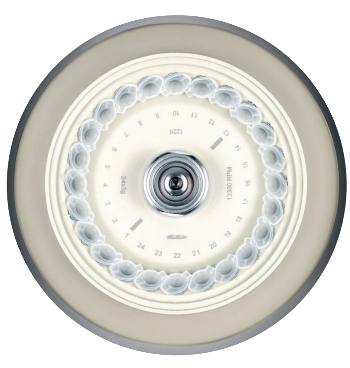
View into the centrifuging chamber showing the rotor 1226